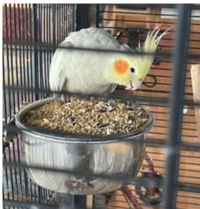
Candy- our female Cockatiel