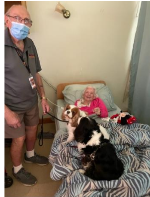
Dogs visiting Barb