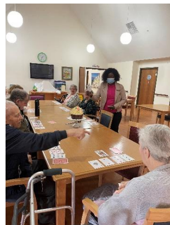
Precious hosting bingo