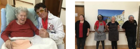
Elvis concert and PHRC 40 th Anniversary