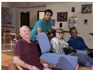
Watching the footy